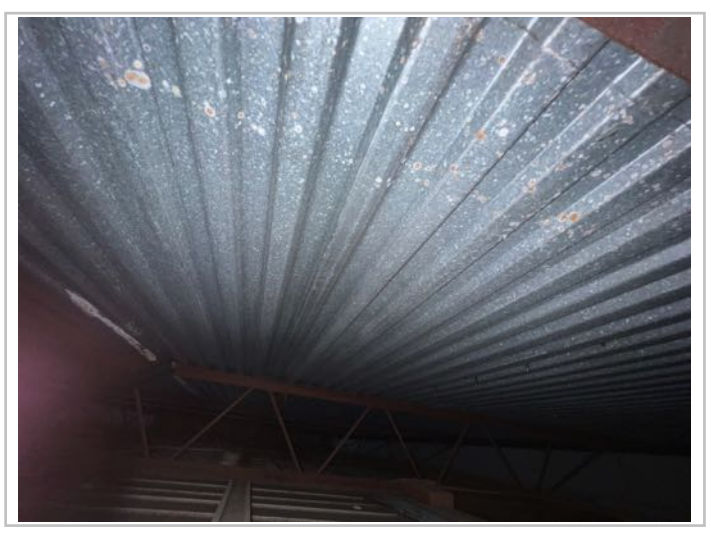
Corrugated concrete form deck